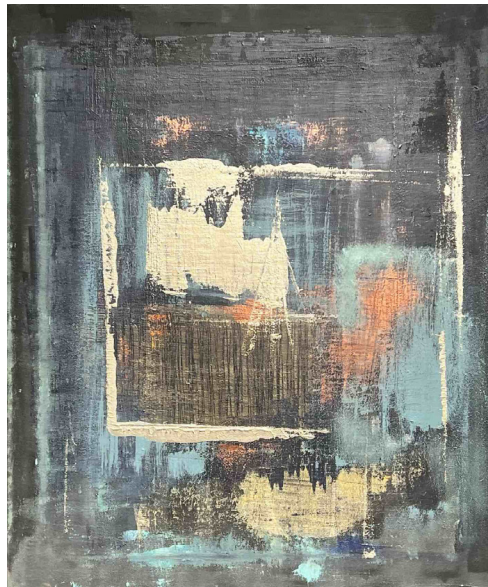
HIDDEN STORIES Acrylic on canvas 90 x 80 cm 2025