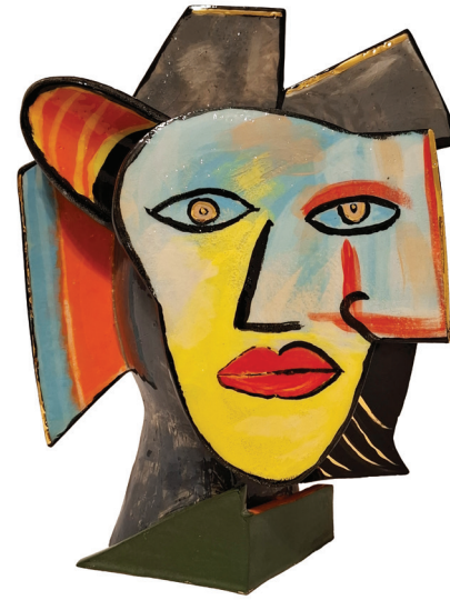
WOMAN WITH BLUE EYES pottery/ engoba /glaze/gold 29 x 11 x 35 cm 2024