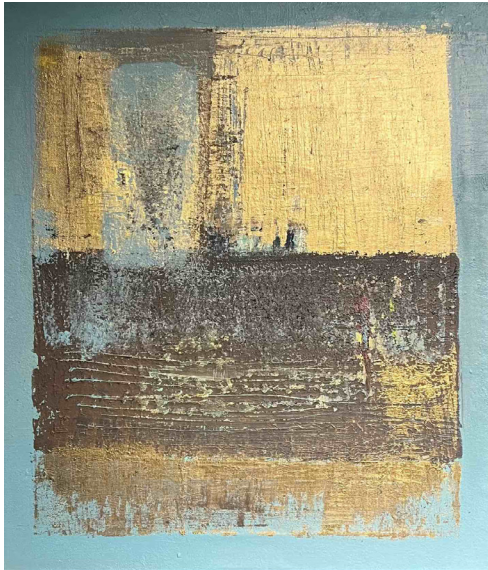
GOLDEN WHISPERS Acrylic on canvas 90 x 80 cm 2025